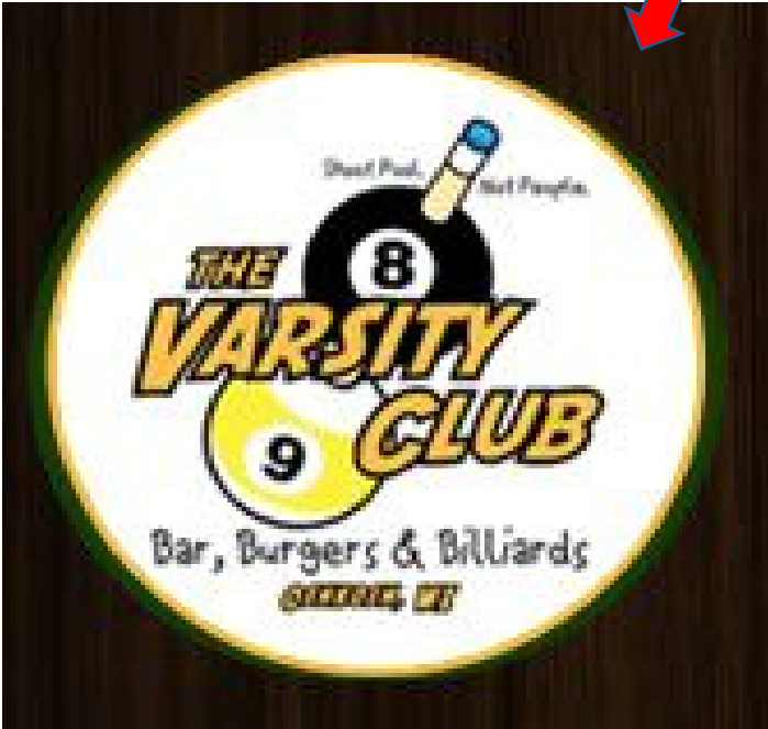
The Varsity Club 570 N. Main St., Oshkosh, WI Brand-New Gabriels Carom Table