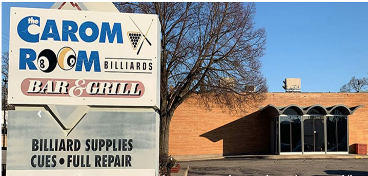
614 E. Grand Ave. Beloit, WI 53511 • (608) 365-1811